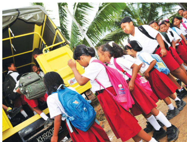
Free school bus services for students

To further encourage our employees and local communities to send their children to school, we provide free school buses for all students.