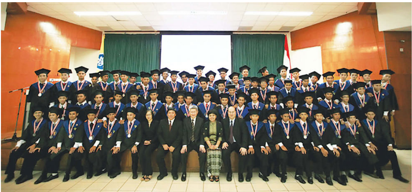
SMART Diploma Graduation Day

The Tjipta Agro Scholarship is awarded and administered by the Eka Tjipta Foundation ("ETF"). This programme offers scholarships to high-performing agriculture undergraduates in 25 universities all over Indonesia. After completing the academic programme, scholars are encouraged to return to their hometowns and contribute to the development of their area. Since its inception in 2006, the programme has funded the education of more than 150 students.